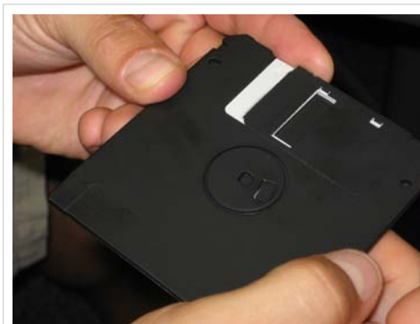
Sliding open the shutter of the black spray-painted 800 Mb diskette reveals white plastic beneath

We finally want to emphasize that we did not in any way “hack” the Agrippa program to accomplish what we describe here. This is important not mainly for legal or ethical cover, but because the language of hacking would obscure what are in fact well-established, open procedures in the digital preservation and forensics community. Hacking has had a colorful place in Agrippa ’s lore. Indeed, I would hold that Templar and his colleagues can indeed claim credit for a “ hack ” of sorts—albeit one that was not fundamentally computational in nature—when they were able to transcribe Gibson’s poem from their bootleg video. But the term “hacking” would lend our work an aura of derring-do that is both deceptive and distracting.