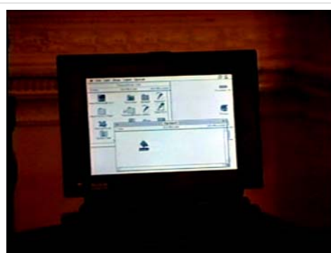
Laptop with open folder containing file called AGRIPPA

As shown in the footage, Begos's Powerbook and its System 7 desktop appears on a table at the front of the room beside the screen. Begos has opened the folder containing a file called AGRIPPA . There is a false start of some kind, and then Begos double-clicks the program again. We briefly see the wristwatch cursor; then his AGRIPPA file opens full screen. As Gibson's poem begins to move up the screen, Penn Jilette's recorded voice immediately cuts in with a recitation, but with the "I" of the first line truncated. Therefore, the audio begins, "[H]esitated before opening. . . ." There is a relatively long pause in the recording after the poem's first three lines, then Jilette resumes. After the line, "Papa's saw mill, Aug. 1919," there is an unidentified disruption in the circumstances at the location of Jilette's reading, and Jilette's recorded voice, rather frantic, is heard to say: "No, we started we can't go back." "Did you get that first part on tape?" "We're okay." "Do you want to start again?" "Okay, let's go." He then resumes his reading, backing up a few lines: "Then he glued his Kodak prints down." (Nervous laughter ensues from the audience at the Americas Society.)