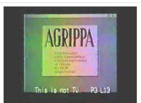
Matching credit and copyright notice at beginning of the 1992 Re:Agrippa remix video

Why this notice is blank in the emulation, we don’t know. Perhaps there is a font missing from the emulator’s boot disk, or perhaps the copy of the program that we imaged was incomplete in some way. Maybe it is only appropriate that our emulation continues the tradition of “rough edges” that Begos mentioned at the Americas Society.