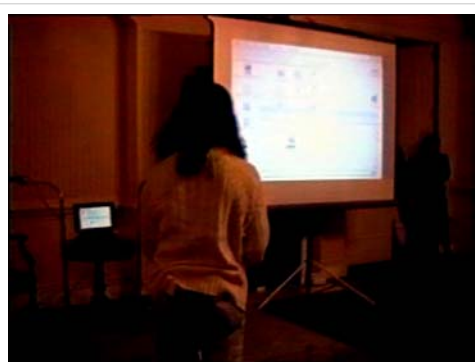
Begos's laptop and big screen at front of Americas Society room

the big screen at the front of the room. Unbeknownst to Begos, et al., however, Templar had also loaded a blank tape into the camera and recorded the video signal.)